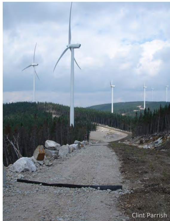
Figure 9. Restoration of forest along road margins helps minimize the permanent footprint of high-elevation infrastructure.