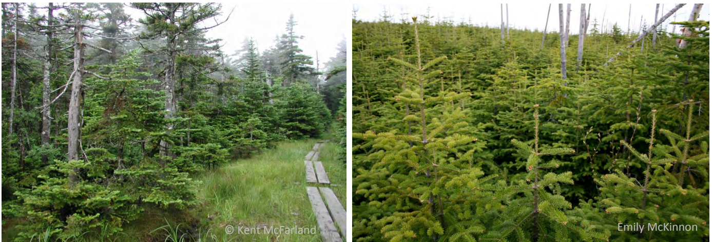
Figure 5. Bicknell's thrush habitat often features complex vertical structure and horizontal patchiness (l), however relatively uniform stands of regenerating fir also provide suitable cover for nesting (r). Snags serve as prominent song perches.