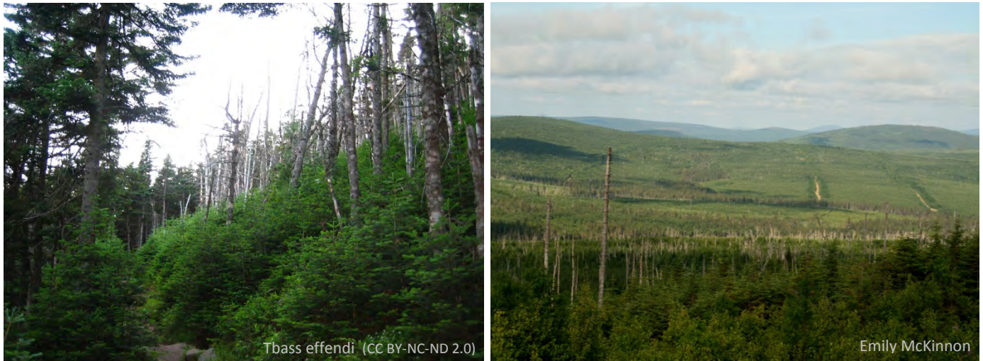
Figure 3. Forests growing on steep slopes with shallow soils (l) are prone to natural disturbances that generate vigorous understory growth. Suitable habitat may also develop on broad, boreal plateaus after a fire, spruce budworm outbreak, or timber harvest (r).

Sites with more than 10 ac of contiguous or clustered habitat should be sufficient to support a social group consisting of at least one female and two or more males. Habitat patches > 20 ac are very likely to be continuously occupied while those < 5 ac may only be used intermittently. 22 Although large and connected habitat units offer the most value to Bicknell's thrush, spatial characteristics should not be the principal consideration in selecting sites for implementing these guidelines. In general, stand characteristics appear to influence Bicknell's thrush colonization and persistence rates more strongly than patch size and configuration. 26