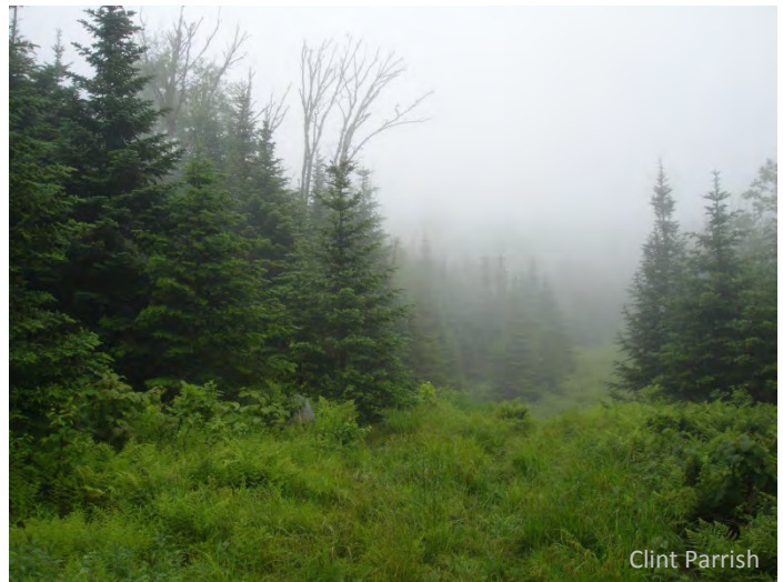
Figure 10. Bicknell's thrushes regularly utilize densely structured forest edges and are known to cross trails and roads < 150 ft wide. 28,43