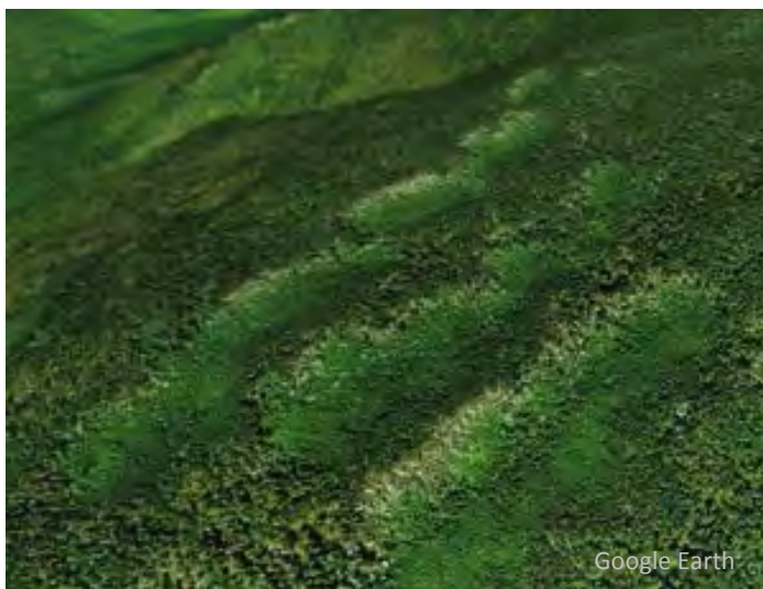
Figure 7. Forest managers seeking to emulate patterns of natural disturbance could mimic the scale and patchiness of natural fir waves, like those shown on Mount Moosilauke, NH (l). These irregular bands of open canopy are usually separated by 100-175 ft and measure < 12 ac in total extent. 40 The disturbance interval in stands shaped by fir waves averages 60 years or less. 41