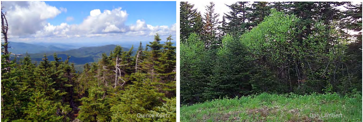
Figure 4. Bicknell's thrushes breed in dense thickets of balsam fir that grow along exposed ridgelines and sheltered trails. Snags provide valuable song perches, especially where canopy trees are absent.

Bicknell's thrushes breed in forests with high densities of saplings or small trees, and low, open, or semi-open canopies, including multi-aged and even-aged stands. These areas occur as ephemeral patches undergoing forest succession after the canopy has been opened by wind-throw, snow or ice damage, timber harvest, insect outbreak, or fire. Persistence of suitable habitat is greatest at high elevations, where thin soils, short summers, and relatively frequent disturbance limit tree growth. Productive habitat also occurs along the edges of chronically disturbed openings, including ski trails, roadways, rockslides, and exposed ridges (Fig. 4). Wherever they breed, Bicknell's thrushes concentrate in patches of thick understory foliage and nest mainly in small balsam fir trees. 2,6 They may preferentially select areas where forest structure is patchy 34 and where snags provide elevated and exposed song perches. 24,26,35