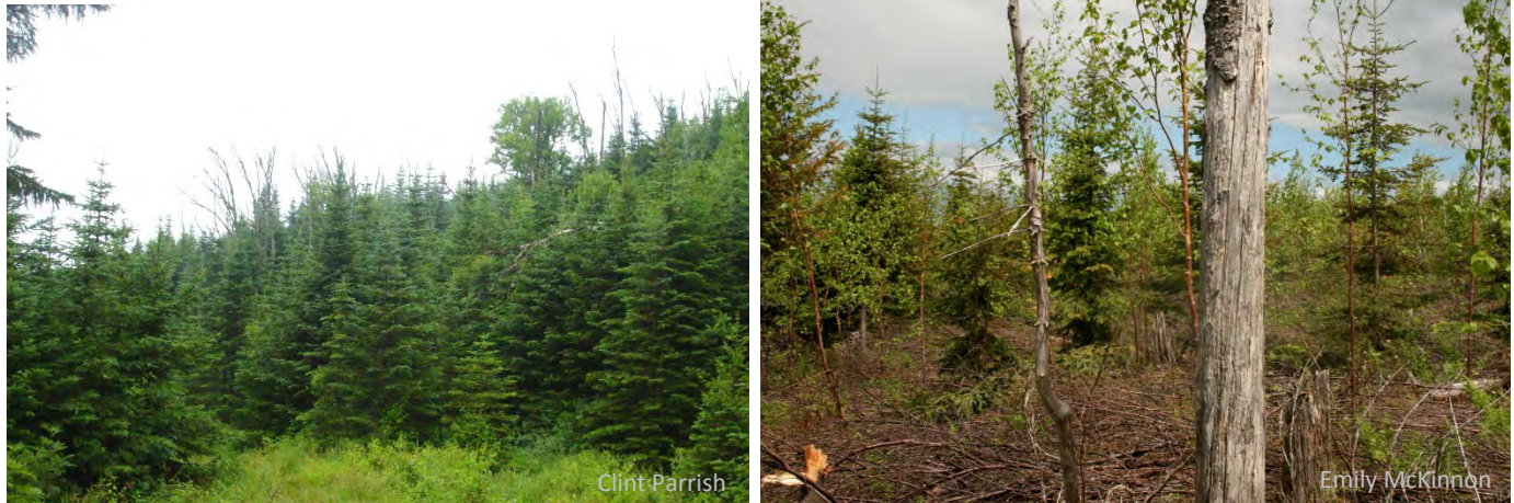
Fig. 6. In forests managed for wood products, unthinned stands (l) and stands thinned with variable retention are more likely than uniformly thinned stands (r) to provide productive breeding habitat for Bicknell's thrush.