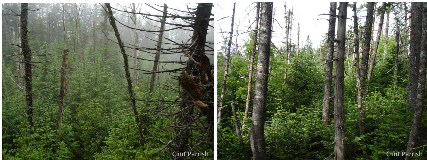
Figure 8. Forest structure in a regenerating group cut with retained snags (l) closely resembles that of a naturally disturbed stand where the canopy has been opened by icing and high winds (r).