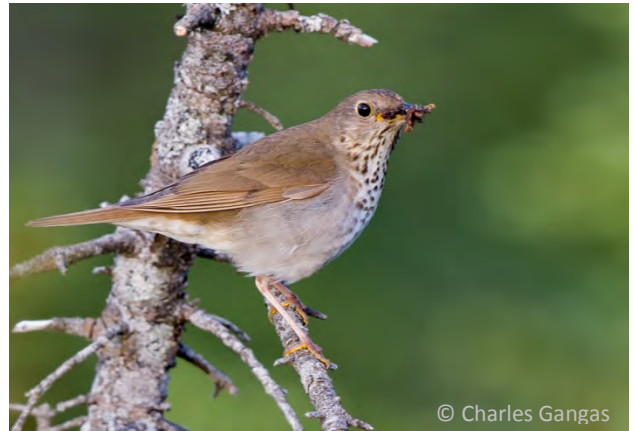
Figure 1. A Bicknell's thrush delivering food to its young.

Other potential stressors on the breeding grounds include mercury contamination 21 and disruption of the balsam fir masting cycle, which could result in consistently higher rates of nest predation by red squirrels. 22 By comparison, habitat removal and alteration could influence Bicknell's thrush populations more directly. Although most US breeding areas occur on conserved lands, recreational development, wind energy facilities and commercial timber management are permissible in some habitat units. Effects of these activities vary with the type and scale of disturbance as well as the broader landscape context.